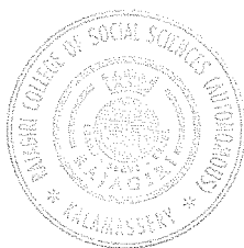
Controller of Examinations